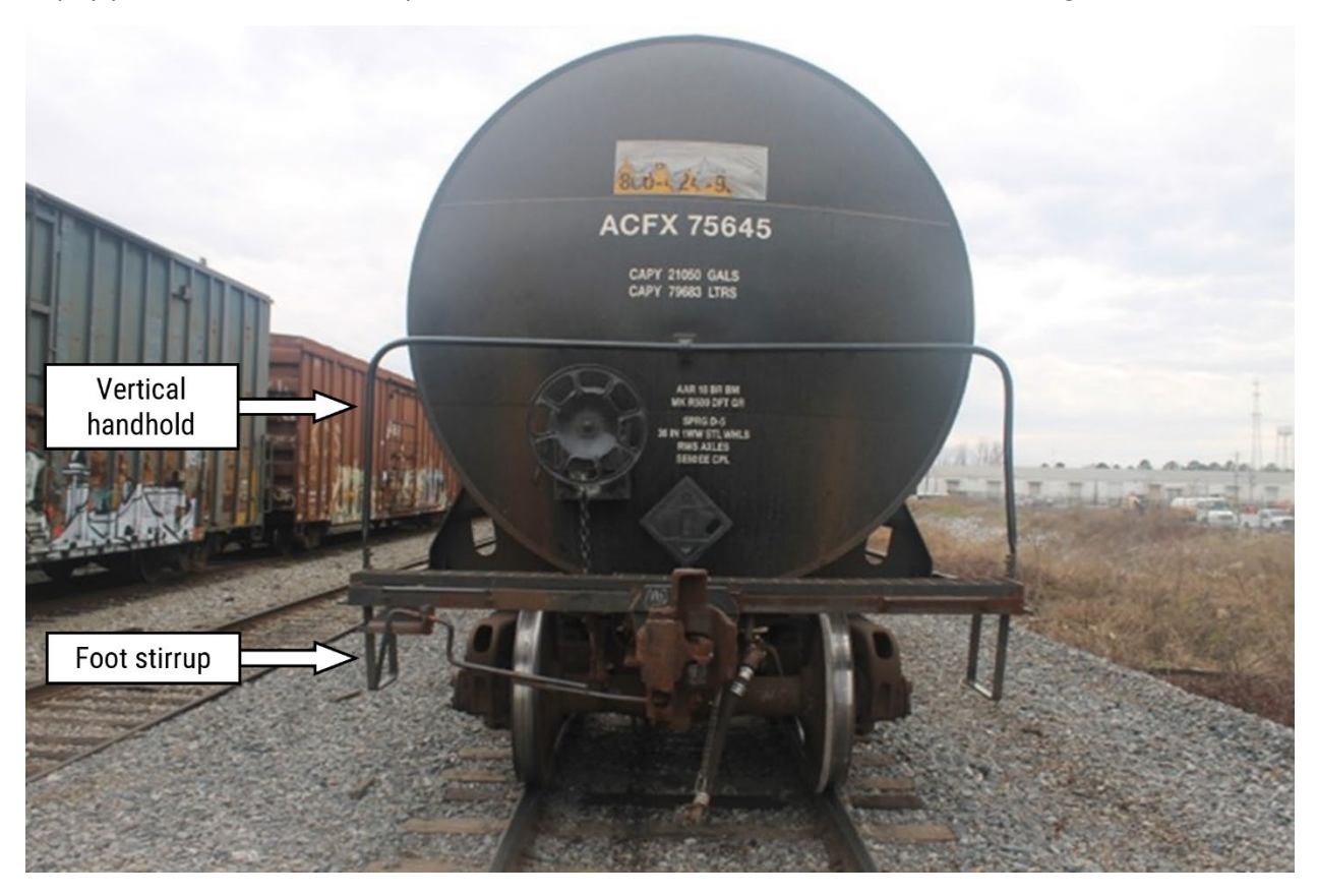
Figure 3. The end of the railcar where the conductor was riding.

The railcar that the conductor was riding was a DOT-111 tank car. The railcar was equipped with a foot stirrup and vertical handhold at each corner. (See figure 3.)